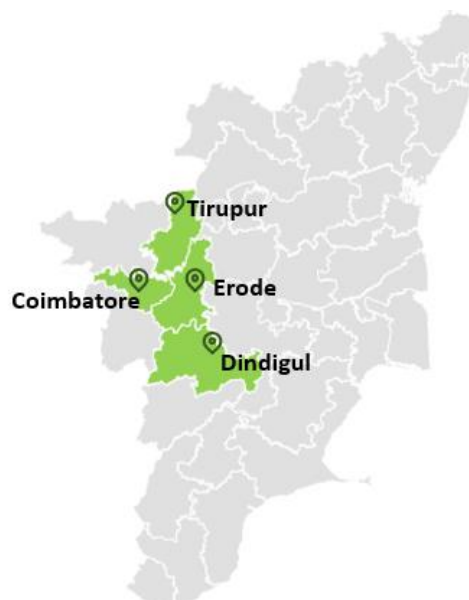
Figure 3 Focus Districts of MSI-TN

MSI-TN brings key stakeholders from Tamil Nadu T&A industry such as government officials, trade unions, trade associations, NGOs, industry players and international organisations on a common platform. Together, the partners introduce change at two levels as elaborated below: