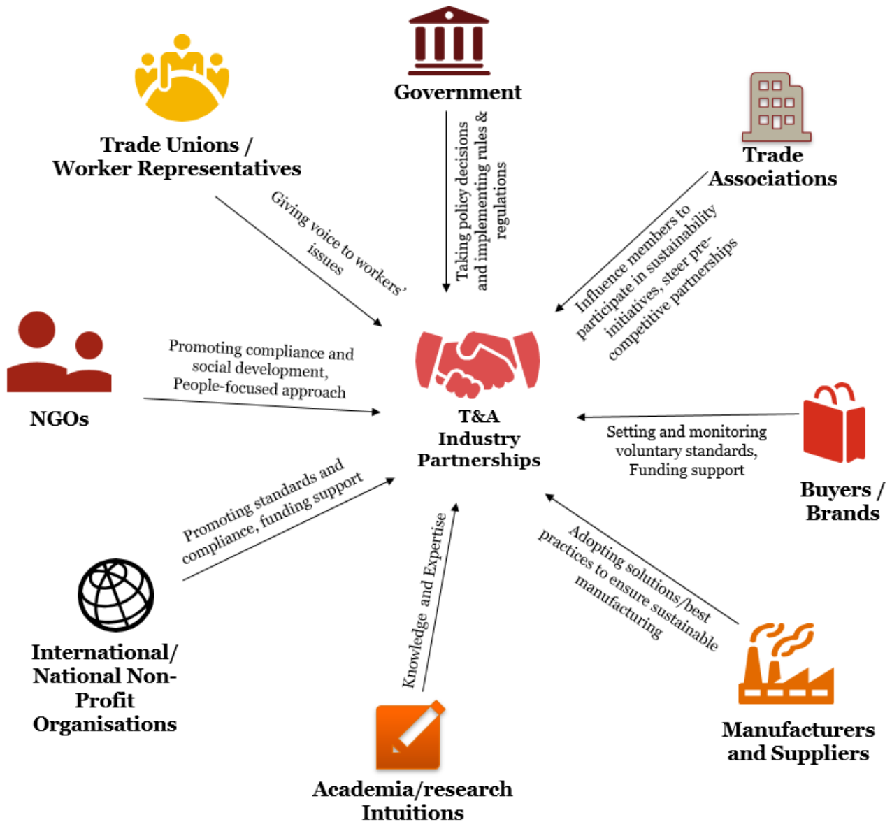
Figure 2 Key stakeholders involved in T&A industry partnerships

Key stakeholders involved in partnerships in the T&A industry are illustrated in the figure below: